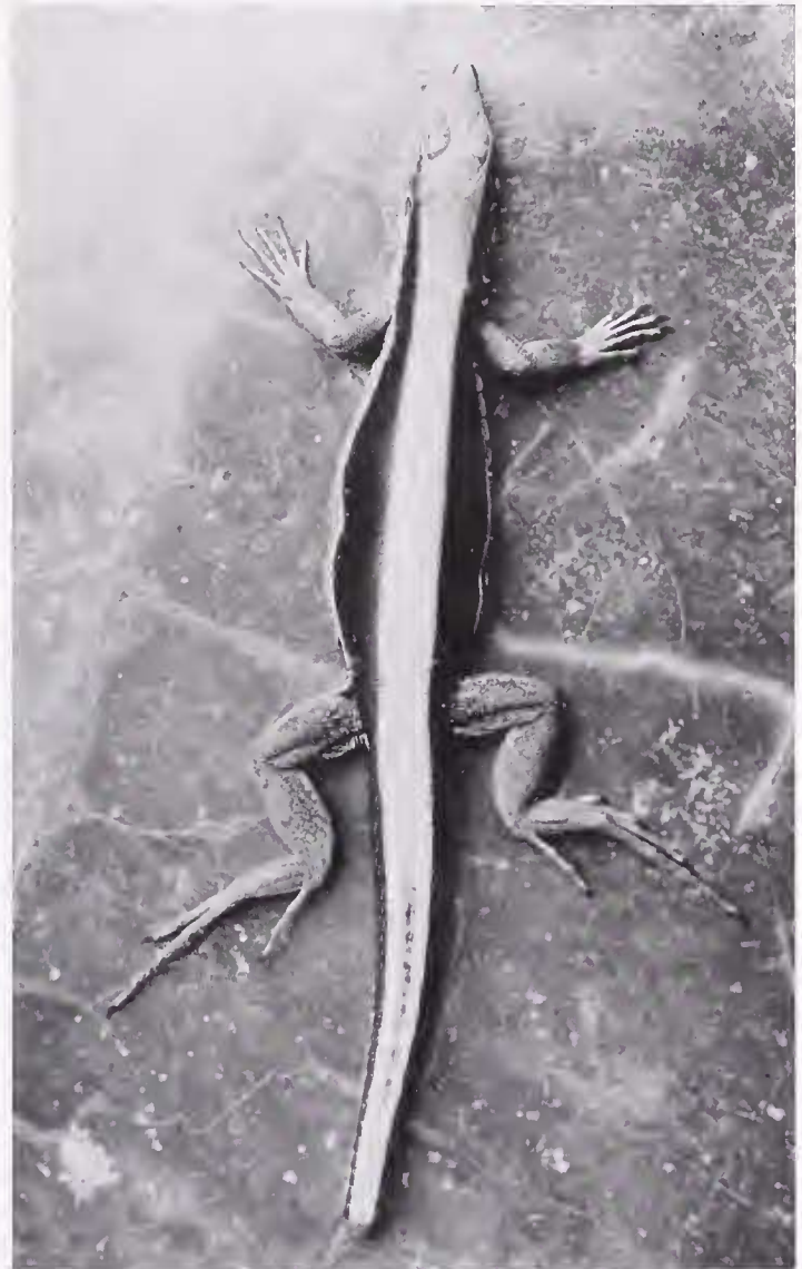
Fig. 6: Ameiva taeniura rosamondae [Milwaukee Public Museum 18886] collected at Mano Juan, Isla Saona, Dominican Republic.

full of lizards. We sat for awhile on the porch of the pitiful little rectory, conversing in our pretty poor French, and with difficulty reimbursed the priest for the money that he had dispensed among his flock for catching the lizards. We walked back down the hill, after a long and wonderful day which neither Rosamond nor I will ever forget. I then climbed the long gangway on board the Utowana for the last time. I left her in Miami on the 20 th of April, 1934" (BARBOUR 1945).